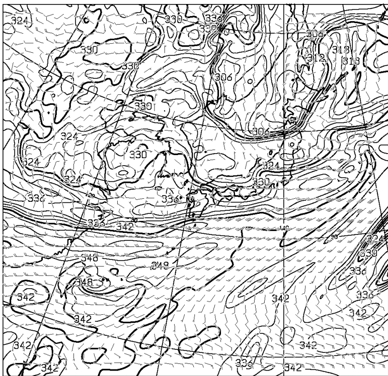
T=24 850hPa: E.P. TEMP(K), WIND(KNOTS) VALID 260000UTC